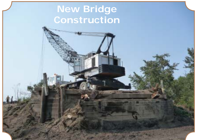
New Bridge Construction