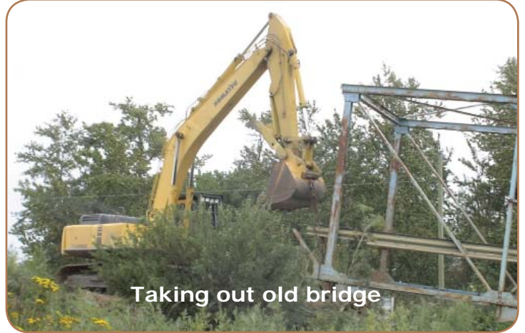
Taking out old bridge