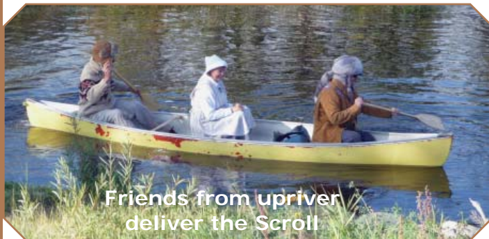
Friends from upriver deliver the Scroll