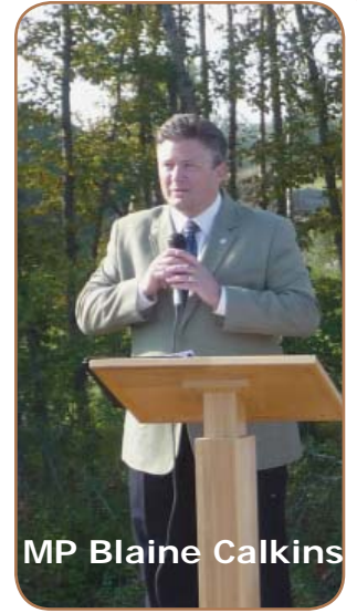
MP Blaine Calkins