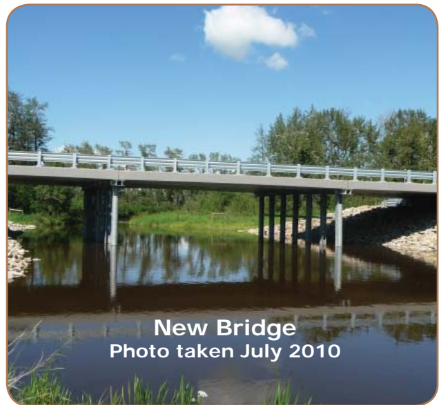
New Bridge Photo taken July 2010