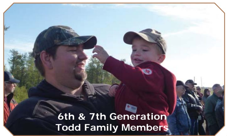
6th & 7th Generation Todd Family Members

The inscription on the plaque shown to the left reads: