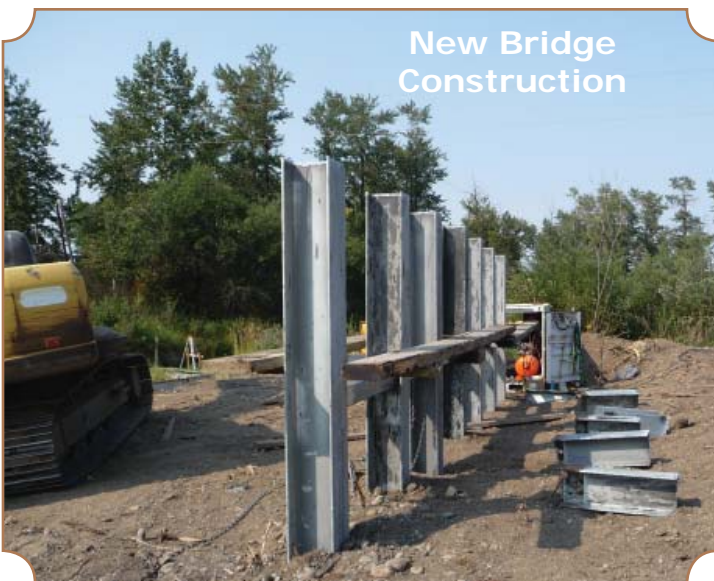
New Bridge Construction