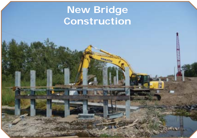
New Bridge Construction